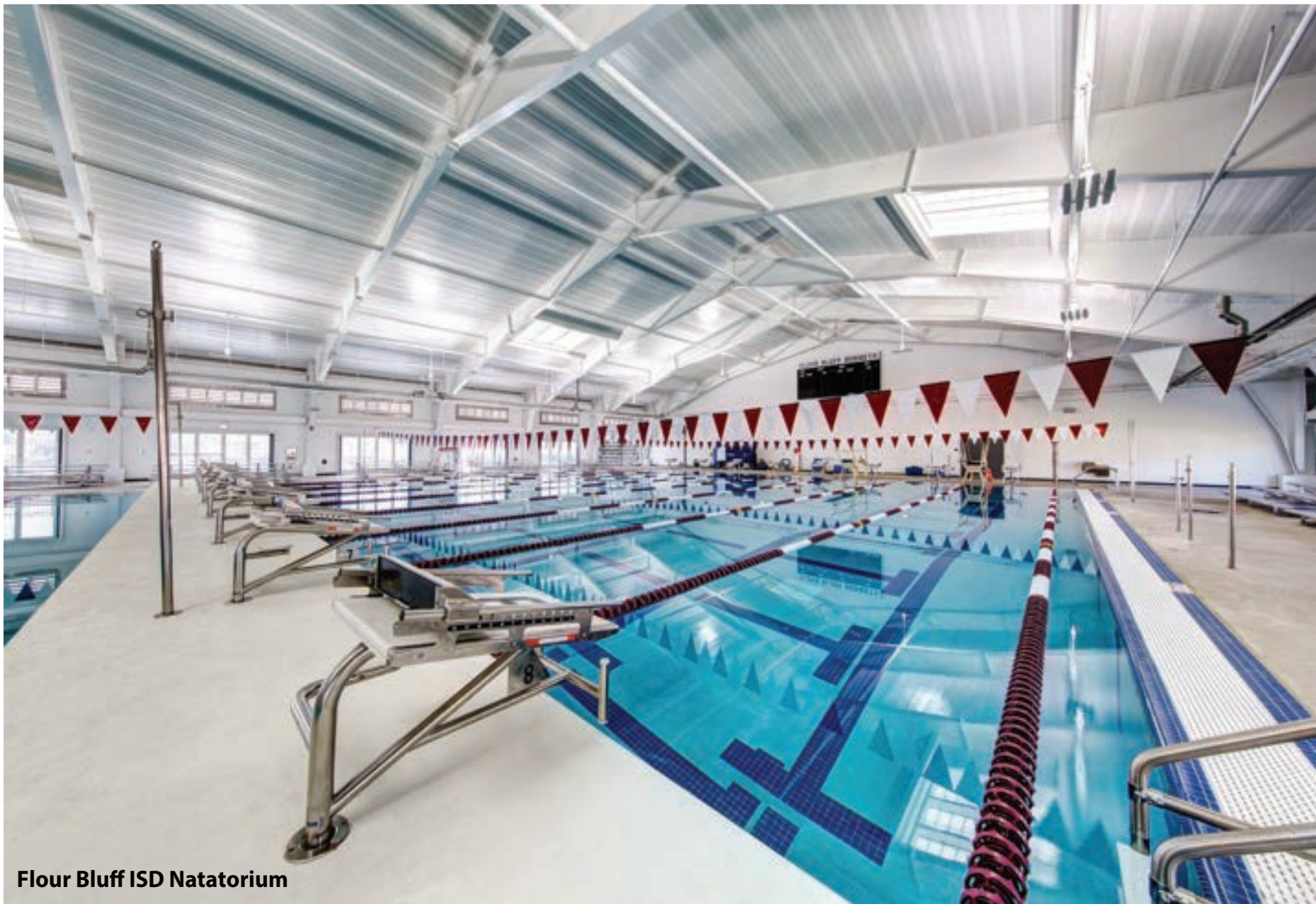
Flour Bluff ISD Natatorium