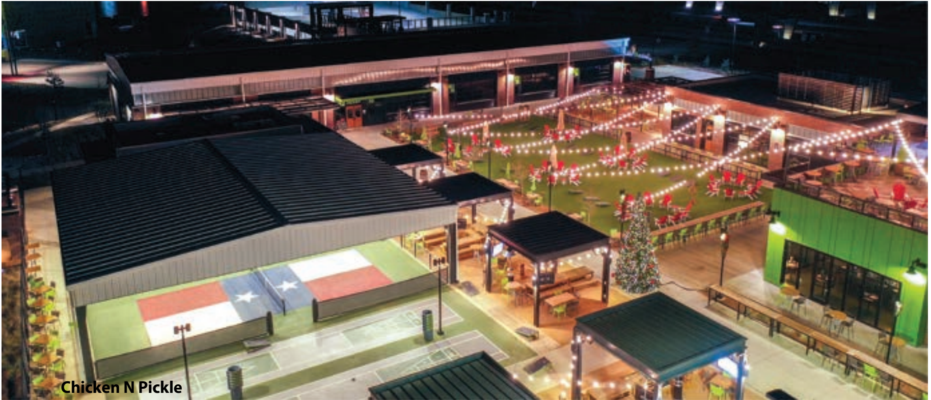
Chicken N Pickle