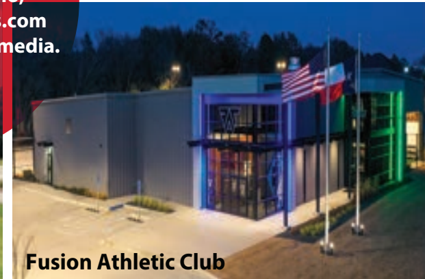
Fusion Athletic Club