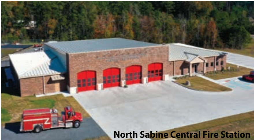
North Sabine Central Fire Station