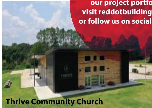
Thrive Community Church