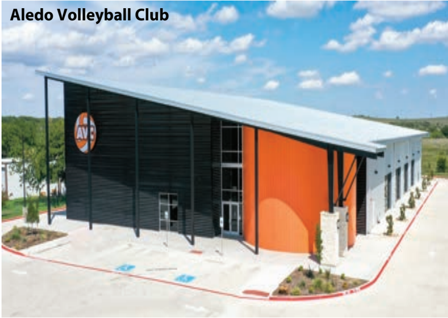
Aledo Volleyball Club