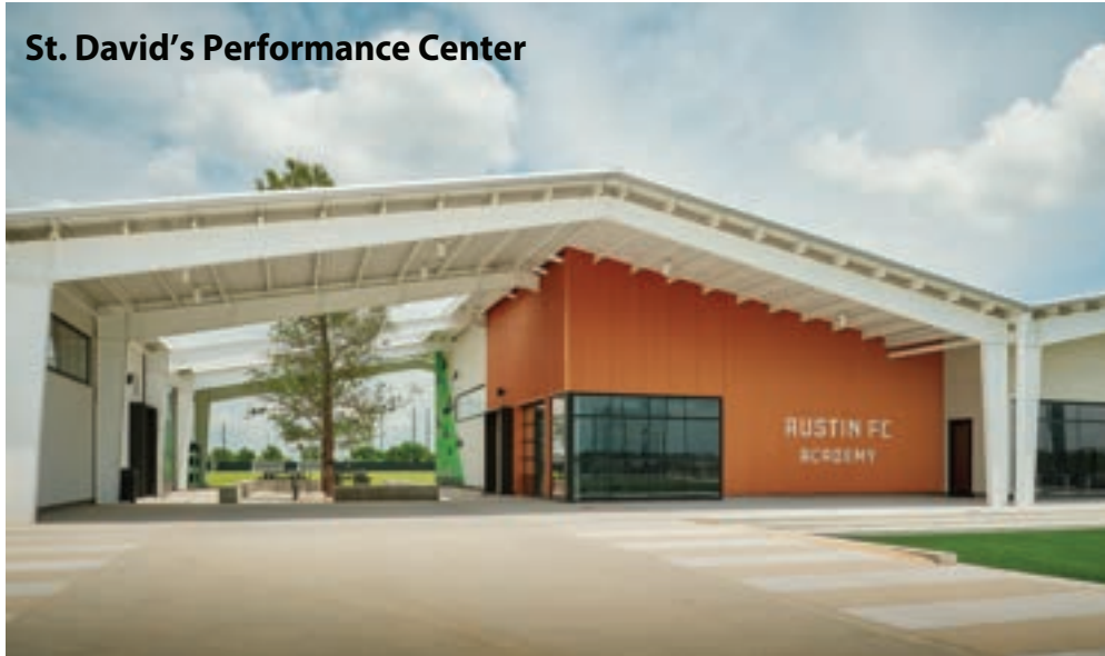
St. David's Performance Center

Strong and adaptable steel buildings for complex projects