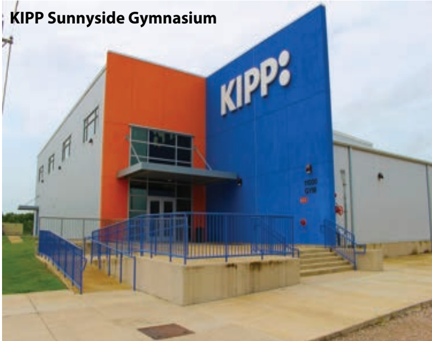
KIPP Sunnyside Gymnasium