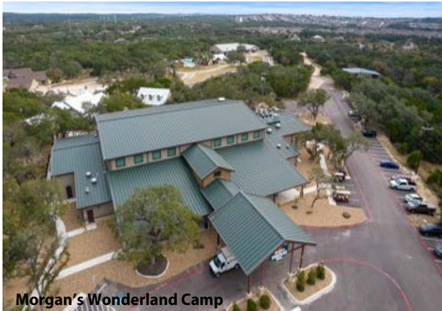
Morgan's Wonderland Camp