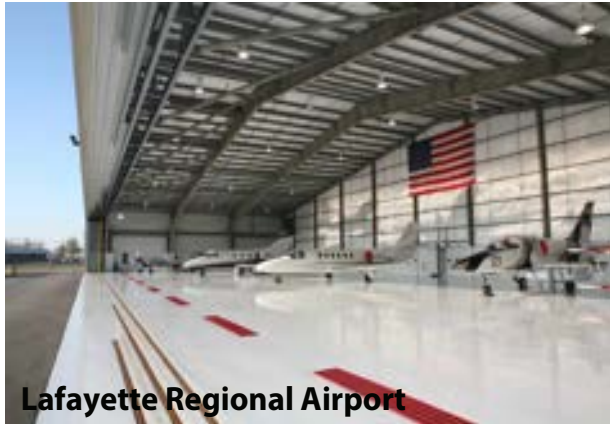
Lafayette Regional Airport

Like what you see? To view more of our project portfolio, visit reddotbuildings.com or follow us on social media.