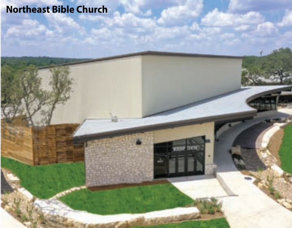
Northeast Bible Church